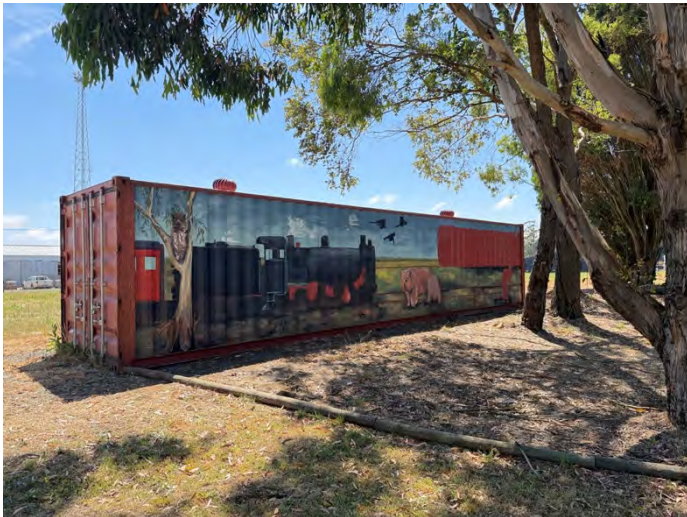
The mural in progress

Our Inclusive Native Garden Mural is progressing well and is close to completion. Once the paint dries on the shipping container, we'll be starting work on creating the surrounding native garden. This will include planting of new natives, the creation of a path and a meditative seating space. When finished, the area will be another distinctive asset for the town and the station precinct.