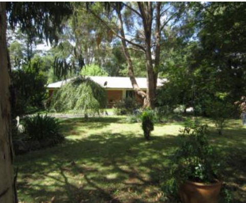
TRENTHAM 8 High St A very comfortable home set on around one acre in the centre of the township. Good sheds, 3 phase power. Giant Cedars and other conifers set off this wondrous space. $560,000