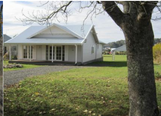
TRENTHAM 44 Cosmo Rd Classic weatherboard with three bedrooms plus study on around 1,500 sm. East facing kitchen /dining, separate lounge, separate living, two bathrooms, new carport, new roof, stumps, wiring and plumbing. $415,000