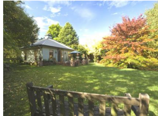
TRENTHAM 3 Mulcahys Rd Stunning award winning garden of around half an acre surrounding a classic English Country home. Two bedrooms and substantial entertaining areas, gallery etc. $780,000

Please phone our office on 5424 1866 for a free appraisal