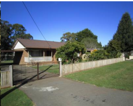
TRENTHAM 10 Blue Mount Rd Quality Brick Veneer on 1100 sq meter block. The residence consists of three bedrooms, open plan/kitchen living area, separate laundry and north facing lounge. Gas and electric heating. Good shed. $360,000