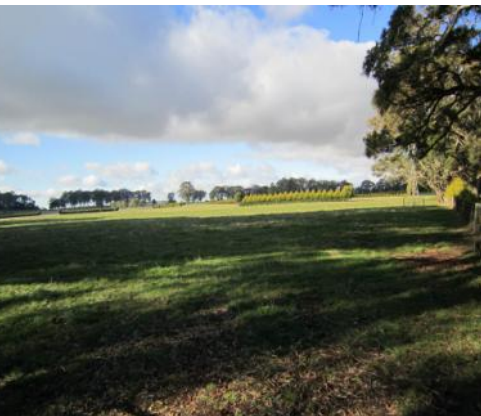
TRENTHAM Daylesford Rd Around 48 acres in the Golden Triangle. Ten paddocks, bore good fencing. Subject to Planning Application for Dwelling. Sealed roads on three frontages. $550,000