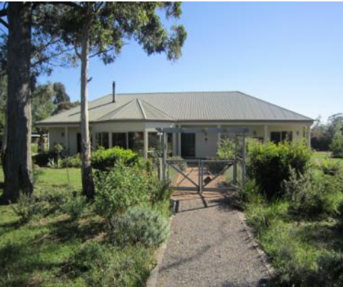
TRENTHAM 1 Groves St A taste of French provincial living in the heart of the Macedon Ranges. Valparaiseaux has been designed with luxurious living in mind. On land in excess of half an acre. $525,000