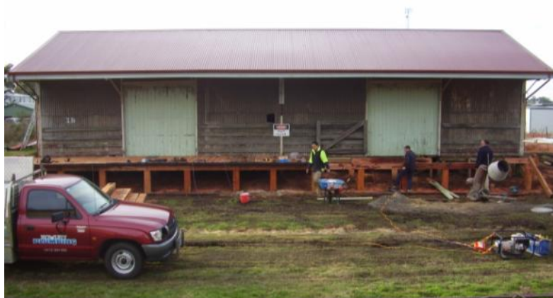
Replacing the platform on the old goods sheds

A very large thanks is due to V Track for the works carried out which will enable the shed, in the near future, to be used for a variety of community uses.