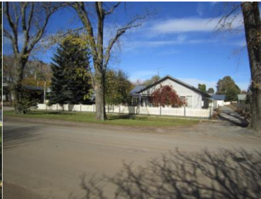
TRENTHAM 29 Victoria St Beautifully renovated period home on quarter acre. Spacious open plan living /kitchen/dining, two bathrooms, four bedrooms, modern kitchen, studio, workshop and double undercover parking. $565,000