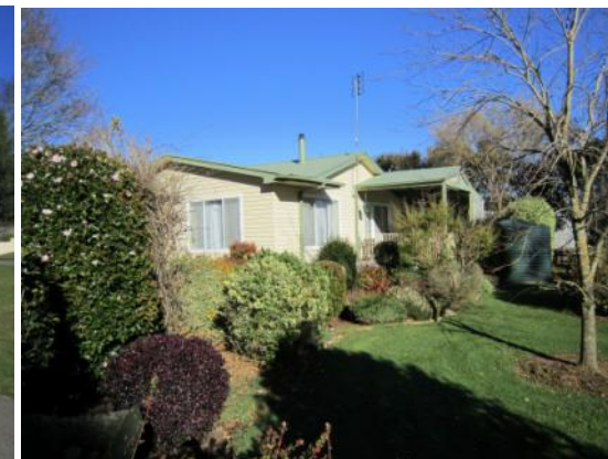
TRENTHAM Glenlyon Rd Around 44 acres of excellent farm land. Three bedroom weatherboard home in excellent condition. Large 100' X 60" shed along with workshop and hay shed. $750,000