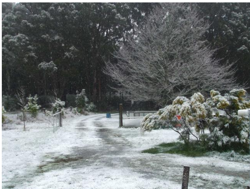
Lockheeds Rd, Little Hampton—Friday 17/08/12