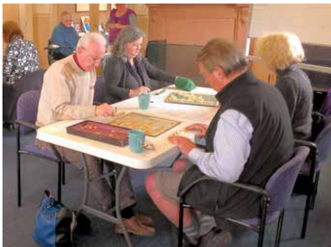
Concentrating at Speed Scrabble.

THE TRUMPET ANTICIPATES PUBLISHING ALL THE WINNING ENTRIES INCLUDING THE ELLEN KEMP MEMORIAL WRITING PRIZE THAT INSPIRED THE JUDGE TO COMMENT ON THE HIGH STANDARD OF ENTRIES.