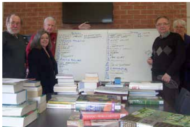
2014 Clever Towns Challenge Team