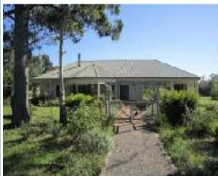
TRENTHAM 1 Groves St

A taste of French provincial living in the heart of the Macedon Ranges. Valparaiseaux has been designed with luxurious living in mind. On land in excess of half an acre.