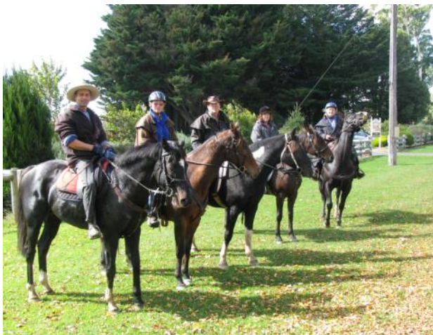
Rideability riders returning to camp