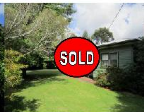
TRENTHAM 31 Market St

At around 1,400 square metres this old Forestry Commission Office and land provides a great opportunity for further development, Subject to Council Approval.