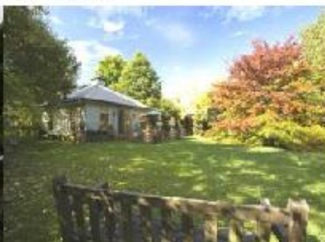
TRENTHAM 3 Mulcahys Rd

Stunning award winning garden of around half an acre surrounding a classic English Country home. Two bedrooms and substantial entertaining areas, gallery etc.