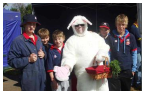
Easter Bunny with CFA Juniors

Enquiries: Tracey Roy; 5424 1185 / 0447 836 171 trenthamfarmersmarket@yahoo.com.au