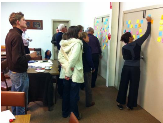
Brainstorming at planning meeting

people would say that we are already seeing a housing boom over the past 12-18 months. So, questions of higher-density subdivisions, the future of the 1-acre block, in-fill and the infrastructure to service a growing