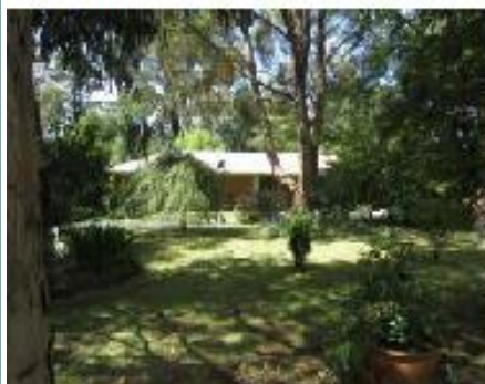
TRENTHAM 8 High St

A very comfortable home set on around one acre in the centre of the township. Good sheds, 3 phase power. Giant Cedars and other conifers set off this wondrous space.