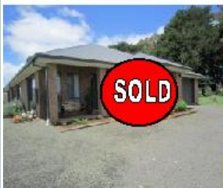
TRENTHAM 9 Rocke Crt

Near new, 30 plus squares on land in excess of one acre. Comprising four bedrooms, two bathrooms. Gas central heating, evaporative cooling and excellent insulation. Two car garage.