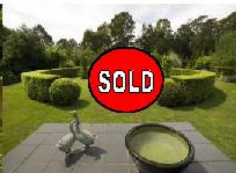
TRENTHAM 36 Mulcahys Rd

Stunning example of contemporary residential design combined with classic Italian gardens covering an area of an acre and a quarter. The concept is based on a Roman house and garden from the 2 nd Century.