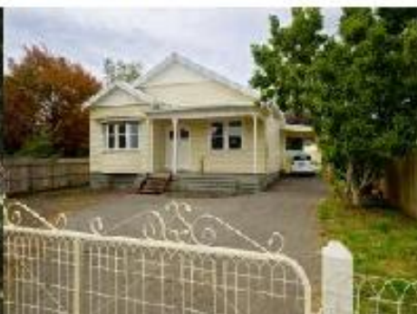
TRENTHAM 4 Park St

Fully renovated Art Deco home on large block. New roof, stumps, wiring, plumbing. Two bathrooms, modern kitchen and all original wood work. Polished hardwood floors. Two/three bedrooms.