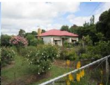
TRENTHAM 56 Cosmo Rd

Fabulous site of around 2.84 acres zoned residential and possible subdivision opportunity. Comprises a spacious 3 bedroom home, workshop, barn and lots space to develop a small produce farm.