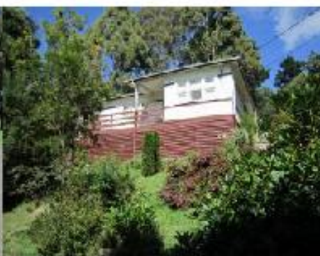
BLACKWOOD 25 Bates Rd

Large 1940's style dwelling in great elevated position on just under half an acre. Two large bedrooms. Separate dining, separate living area and sun room. Large garage workshop and mature garden setting.